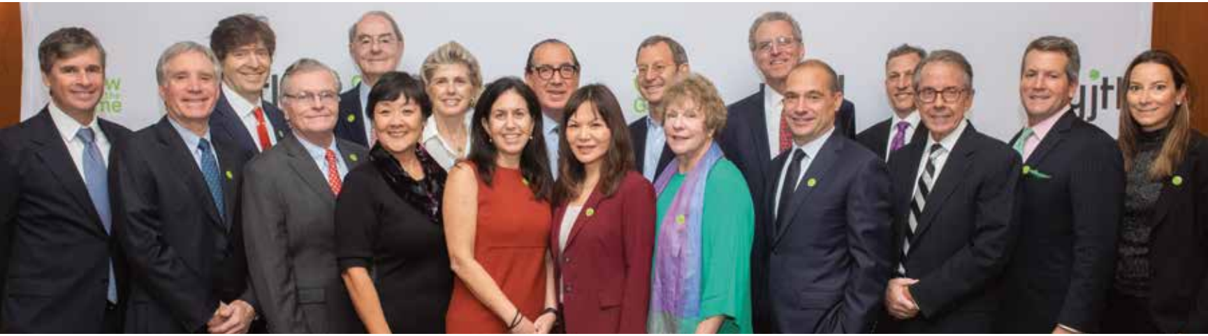
NYJTL Board members at the 2018 Leadership Luncheon.