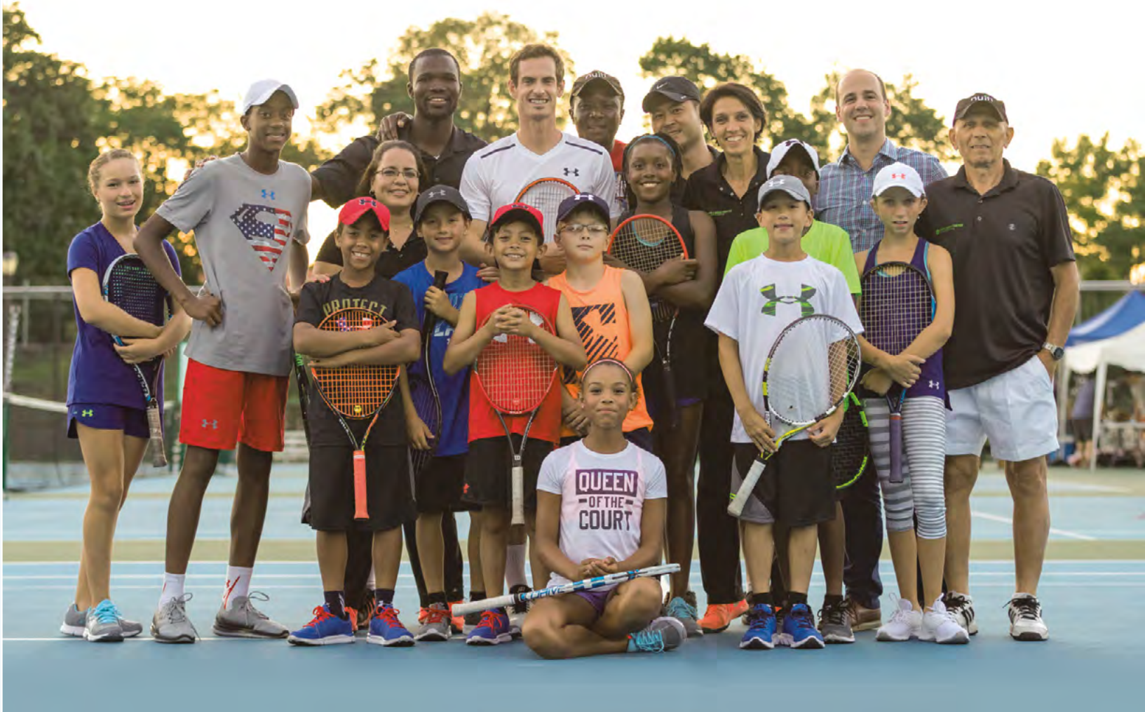
The state-of-the-art Cary Leeds Center was selected for the filming of an Under Armour commercial featuring Grand Slam Champion Andy Murray. NYJTL's Tournament Team participated alongside their idol.