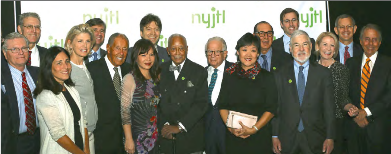
NYJTL Board members at the annual Leadership Luncheon with honorees Hall of Fame coach, Nick Bollettieri and former Mayor David Dinkins.