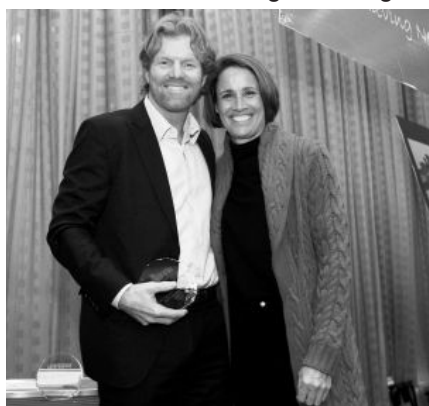
Jim Courier and Mary Carillo