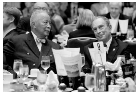
Former Mayor David Dinkins and Mayor Bloomberg